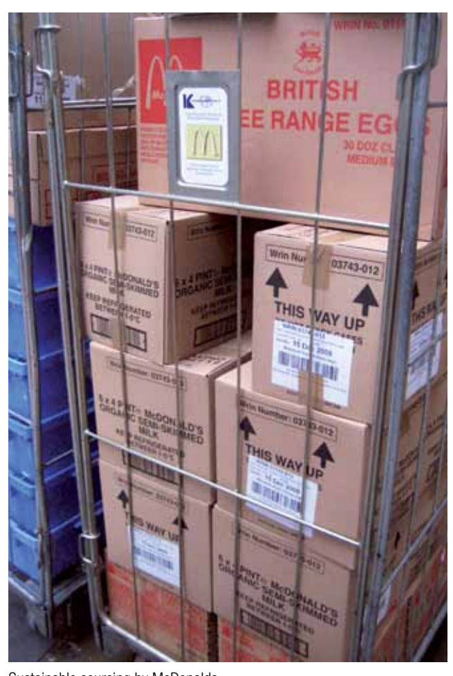
Sustainable sourcing by McDonalds