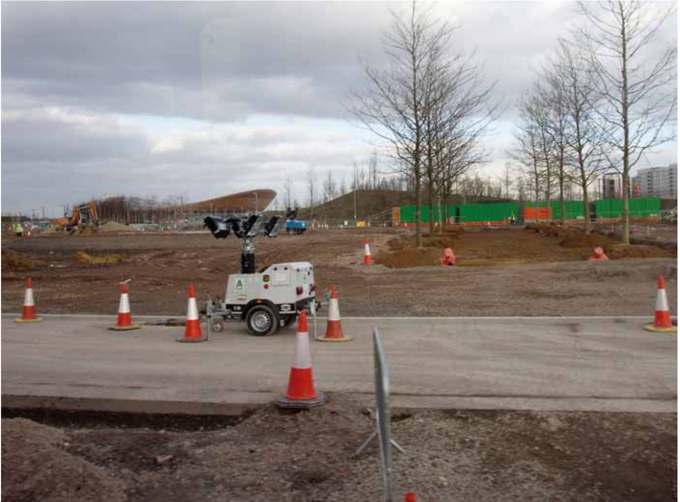
The Olympic Park during transformation