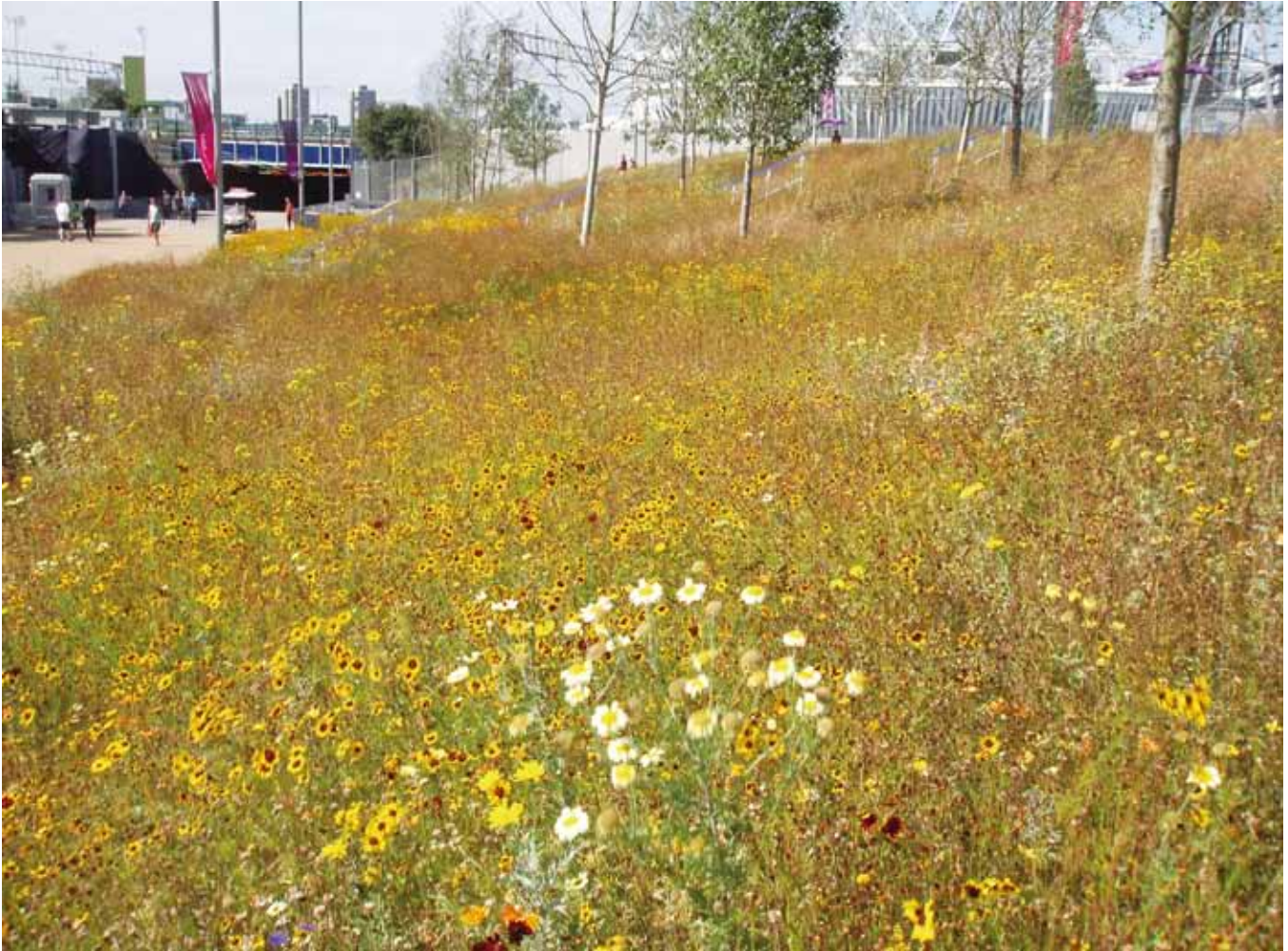
The golden summer of 2012