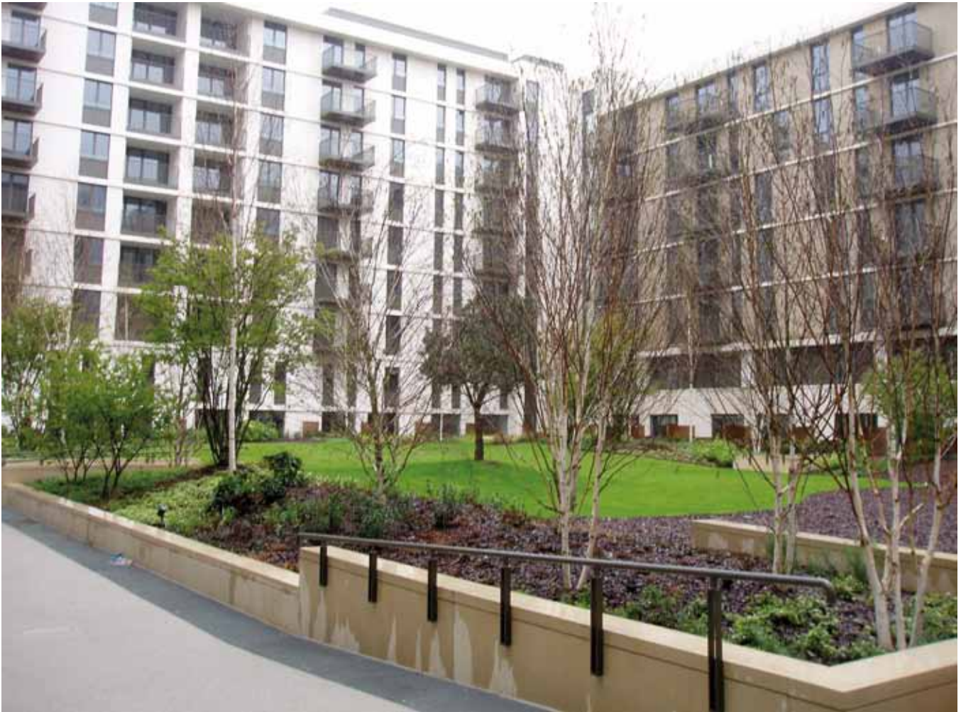
Interior courtyard at the Olympic Village