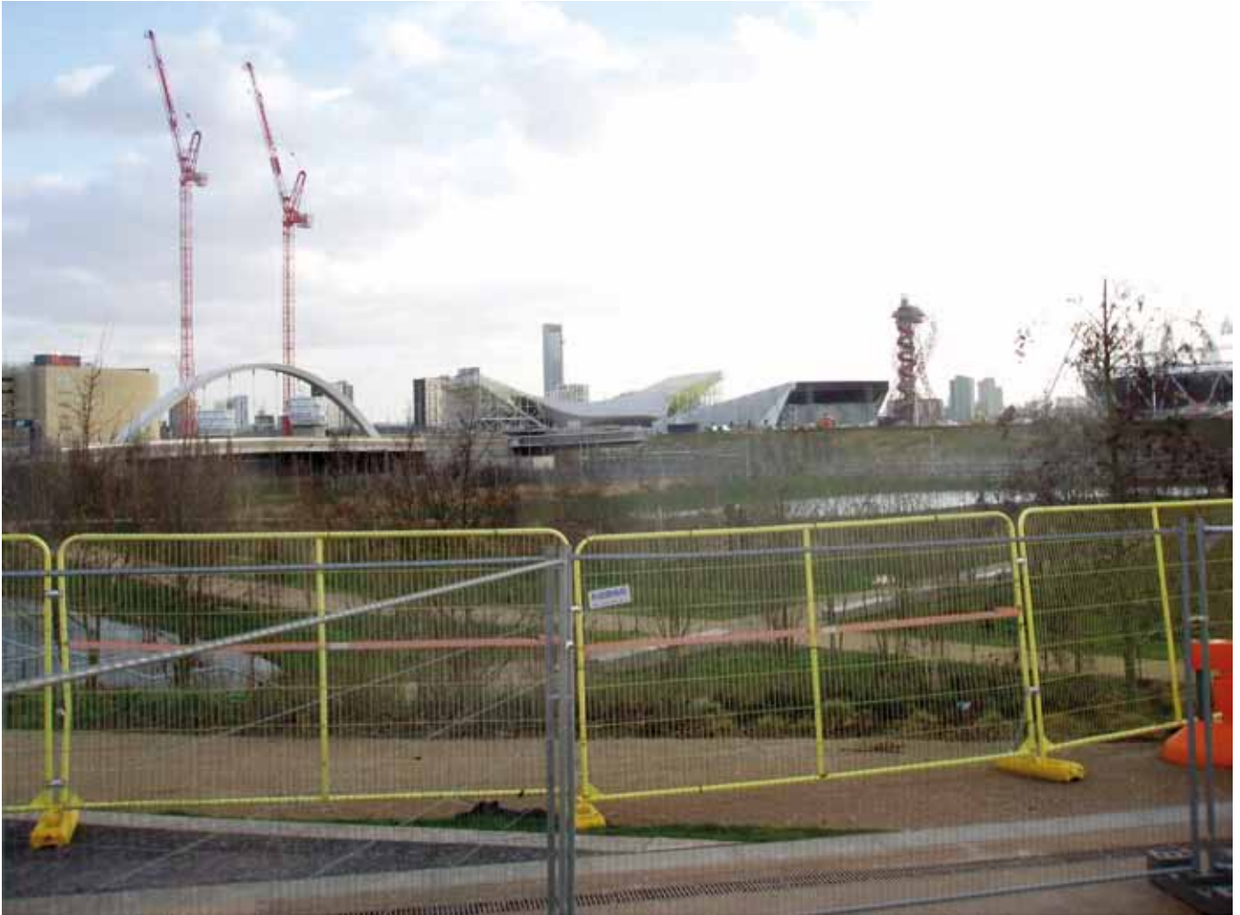
The Olympic Park during transformation