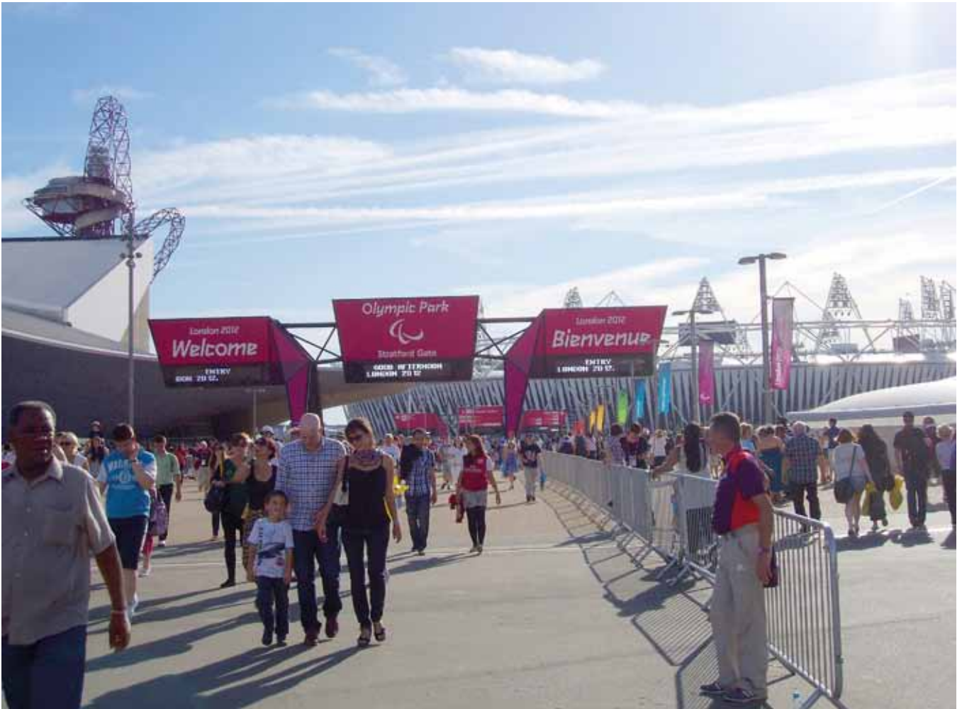
The entrance to the Olympic Park at Games-time